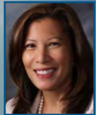
CHIEF JUSTICE TANI CANTIL-SAKAUYE (Ret.) Former Calif. Supreme Court Justice President and CEO, Public Policy Institute of Calif. KEYNOTE CONVERSATION