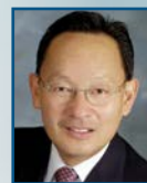
JUSTICE MING W. CHIN (Ret.) Former Calif. Supreme Court Justice ADR Services, Inc. KEYNOTE CONVERSATION