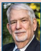
NORMAN PINE Pine Tillett Pine LLP