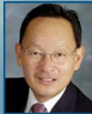
JUSTICE MING W. CHIN (Ret.) Former Calif. Supreme Court Justice ADR Services, Inc. KEYNOTE CONVERSATION